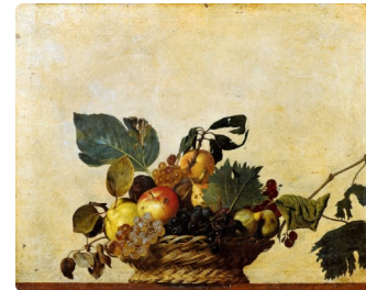
Basket of Fruit 1595–1596

Caravaggio was an Italian painter, born in 1572 and died in 1610. He was known to have painted very quickly with many of his paintings taking less than 2 weeks to complete.