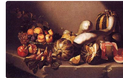
Still life with fruit 1601–1605